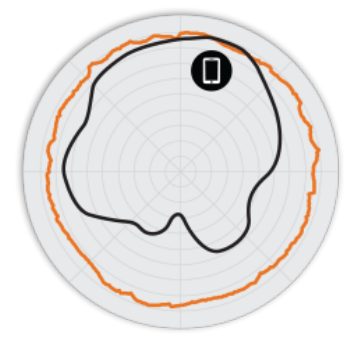
Figure 2. R750 2.4GHz AzimuthAntenna Patterns