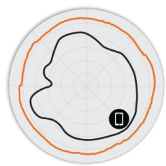
Figure 3. R750 5GHz AzimuthAntenna Patterns