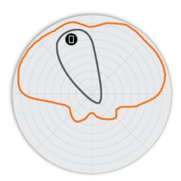
Figure 4. R750 2.4GHz Elevation Antenna Patterns