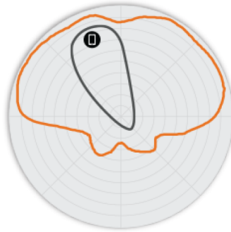
Figure 4. T750 2.4GHz Elevation Antenna Patterns