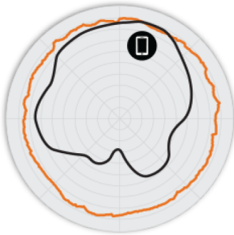
Figure 2. T750 2.4GHz Azimuth Antenna Patterns