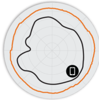
Figure 3. T750 5GHz Azimuth Antenna Patterns