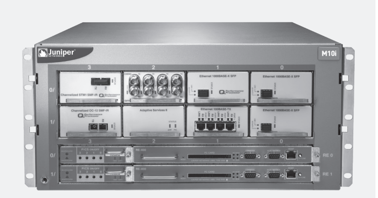
M10i Multiservice Edge Router

All M Series routers support highly scalable J-Protect filtering capabilities, unicast reverse path forwarding and highperformance rate limiting for industry-leading Denial of Service (DOS) attack protection. The J-Protect security capabilities of the M Series can be further enhanced with the Multiservices PIC, hardware that accelerates additional network-based security services such as high-speed NAT, stateful firewall with attack detection and J-Flow accounting. With the rich feature set of Junos OS combined with industry-leading ASIC technology, M Series service-built edge routing provides a new level of reliable and secure service delivery at the edge of service-provider networks.