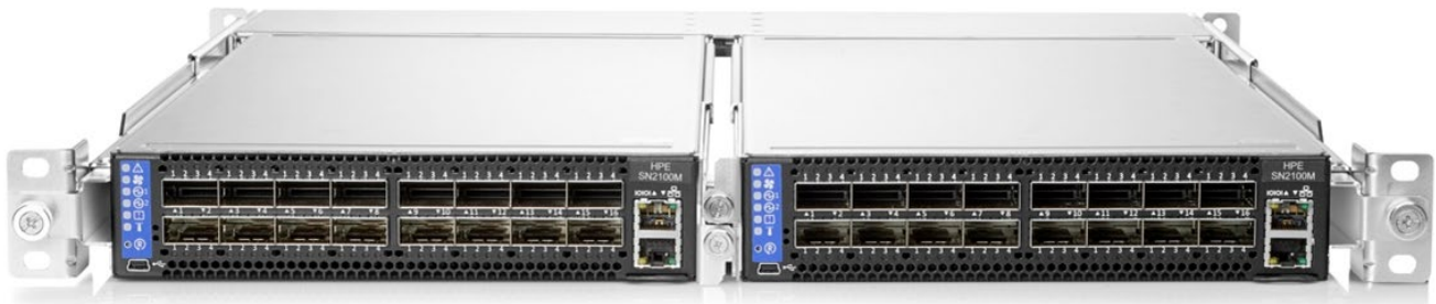
Figure 4: M-Series 2 x SN2100M (With 1U Rack Installation Kit Q2F25A)