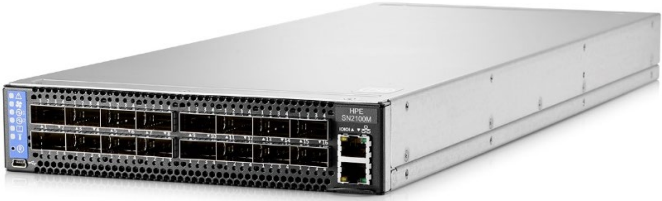
Figure 3: M-Series SN2100M (Side View)