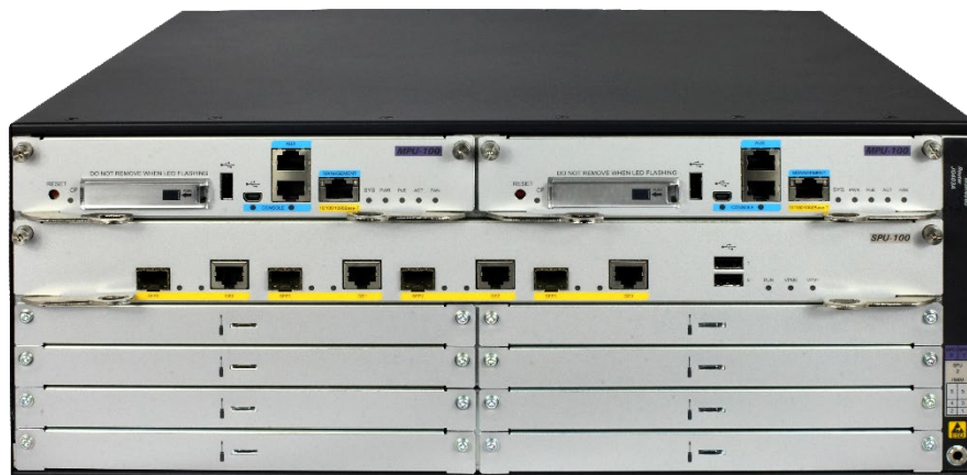
HPE Networking Comware MSR4060 Router Chassis (SPU-100) - Front View