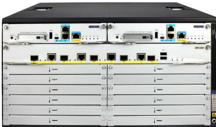
HPE Networking Comware MSR4080 Router Chassis (SPU-200) - Front View

The MSR4000 series provides an agile, flexible network infrastructure that enables you to quickly adapt to your changing business requirements while delivering integrated concurrent services on a single, easy-to-manage platform.