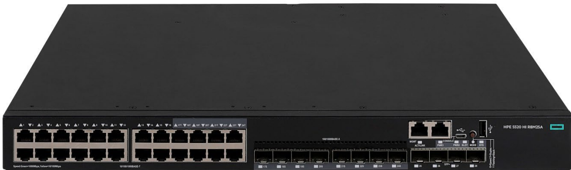
HPE FlexNetwork 5520 24G 4SFP+ HI Switch (R8M25A)

These switches deliver faster performance and advanced L3 features with support for larger ARP/MAC tables and Longest Prefix Match (LPM). VXLAN and EVPN enable multitenant isolation and greater scalability; high availability and resiliency provided by Distributed Resilient Network Interconnect (DRNI), Intelligent Resilient Framework (IRF), Virtual Router Redundancy Protocol (VRRP), Equal-Cost Multipath (ECMP) and Bi-directional Forwarding Detection (BFD). Real-time network health, network and switch performance and visibility provided with Intelligent Management Center (IMC) and Intelligent Network Quality Analyzer (iNQA). Support for IPv4/IPv6, OpenFlow, and MPLS/VPLS features provides investment protection and eases transition from IPv4 to IPv6 networks.