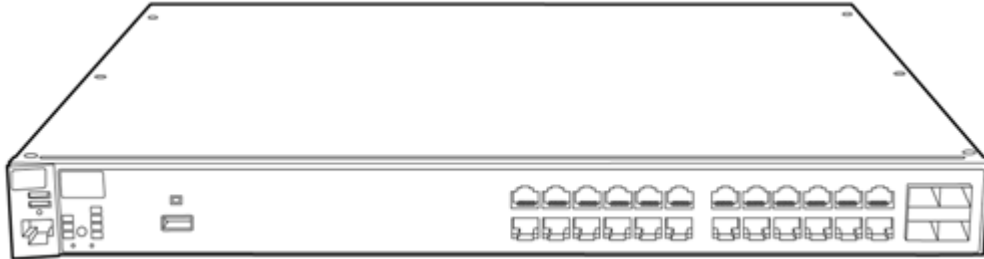
HP 2910-24G al Switch