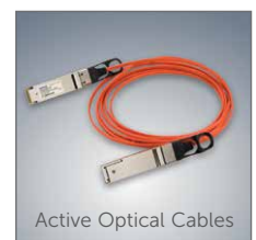
Active Optical Cables

150 Gb/s Parallel Active Optical Cable for 100GbE and InfiniBand 12xQDR