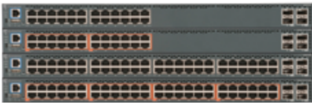
ERS 5900 Stackable Chassis