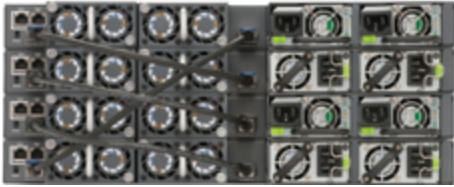
Rear View (highlighting Stackable Chassis cabling)