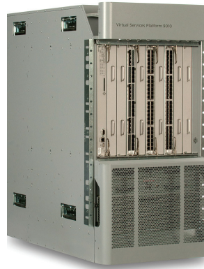
VSP 9010 Ethernet Switch