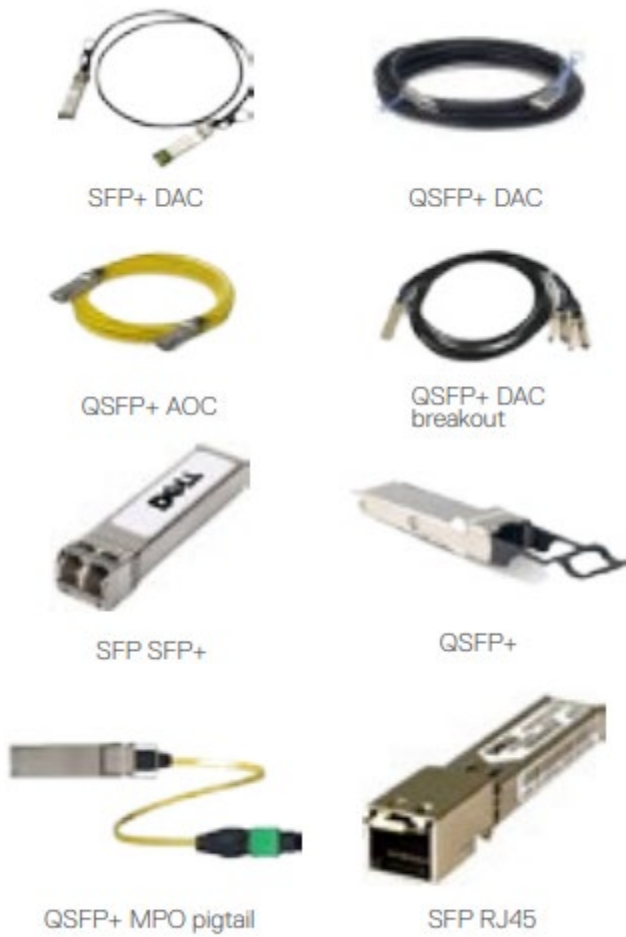
Figure 1 Types of SFP transceivers