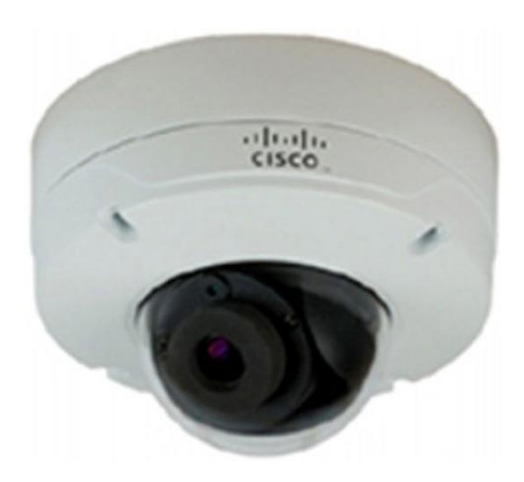
Figure 1. Cisco Video Surveillance 3530 IP Camera

The Cisco Video Surveillance 3530 IP Camera offers a variety of benefits, including: