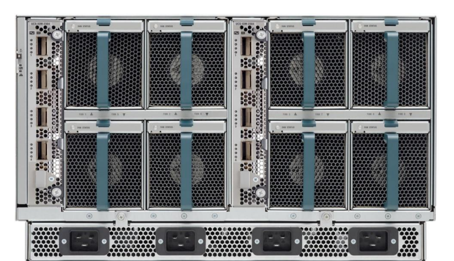
Figure 2. Rear of Cisco UCS 5108 Blade Server Chassis with Two Cisco UCS 2304 Fabric Extenders Inserted

Cisco UCS 2304 Fabric Extenders fit into the back of the Cisco UCS 5100 Series chassis. Each Cisco UCS 5100 Series chassis can support up to two fabric extenders, allowing increased capacity and redundancy (Figure 2).