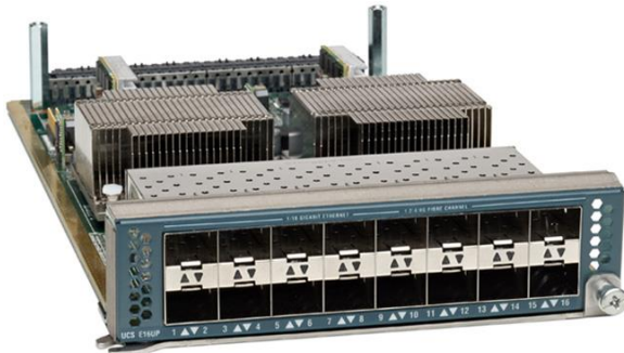
Figure 5. Unified Port 16-Port Expansion Module

The Cisco UCS 6200 Series supports an expansion module that can be used to increase the number of 10 Gigabit Ethernet, FCoE, and Fibre Channel ports (Figure 5). This unified port module provides up to 16 ports that can be configured for 10 Gigabit Ethernet, FCoE, and 1/2/4/8-Gbps native Fibre Channel using the SFP or SFP+ 3 interface for transparent connectivity with existing Fibre Channel networks.