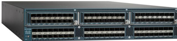
Figure 4. Cisco UCS 6296UP 96-Port Fabric Interconnect

The Cisco UCS 6296UP 96-Port Fabric Interconnect (Figure 4) is a 2RU 10 Gigabit Ethernet, FCoE, and native Fibre Channel switch offering up to 1920 Gbps of throughput and up to 96 ports. The switch has forty-eight 1/10-Gbps fixed Ethernet, FCoE, and Fibre Channel ports and three expansion slots.