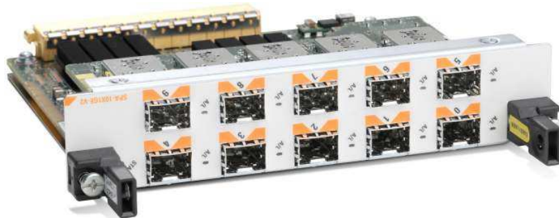
Figure 1. Cisco 10-Port Gigabit Ethernet SPA

The Cisco® Interface Flexibility (I-Flex) design combines shared port adapters (SPAs) and SPA interface processors (SIPs), taking advantage of an extensible design that helps enable service prioritization for voice, video, and data services. Enterprise and service provider customers can take advantage of improved slot economics resulting from modular port adapters that are interchangeable across Cisco routing platforms. The Cisco I-Flex design maximizes connectivity options and offers superior service intelligence through programmable interface processors that deliver line-rate performance. Cisco I-Flex enhances speed-to-service revenue and provides a rich set of quality of service (QoS) features for premium service delivery while effectively reducing the overall cost of ownership. This data sheet contains the specifications for the Cisco 2-, 5-, 8-, and 10-Port Gigabit Ethernet Shared Port Adapters, Version 2 (Figures 1, 2, and 3).