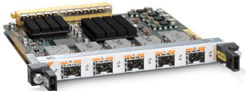
Figure 2. Cisco 5-Port Gigabit Ethernet SPA

The Cisco 2-, 5-, 8-, and 10-Port Gigabit Ethernet SPAs are available on high-end Cisco routing platforms, offering the benefits of network scalability with lower initial costs and ease of upgrades. The Cisco SPA/SIP portfolio continues the company's focus on investment protection along with consistent feature support, broad interface availability, and the latest technology. The Cisco SPA/SIP portfolio allows deployment of different interfaces (Packet over SONET/SDH [PoS], ATM, Ethernet, etc.) on the same interface processor.