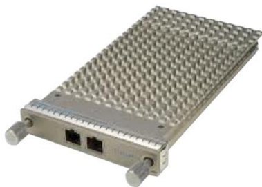
Figure 5. A CFP Transceiver Module for the Cisco ONS Family

A CFP transceiver module (Figure 5) is a bidirectional device with a transmitter and receiver in the same physical package. The module interfaces to the network through a connector interface on the electrical ports and through an MPO or LC connector on the optical ports. The electrical connection of a CFP uses 10x10-Gbps lanes in each direction (receive and transmit), while the optical connection can support both 10x10-Gbps and 4x25-Gbps variants of 100-Gbps interconnects (typically referred to as 100GBASE-SR10 and 100GBASE-LR4 in 10 km reach).