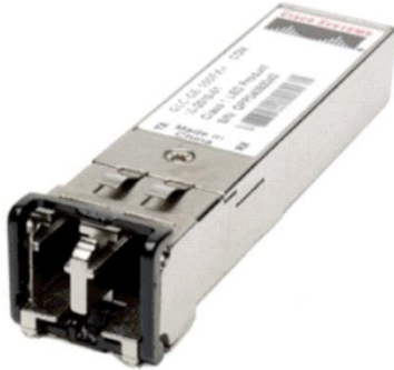
Figure 1. SFP Transceiver Modules for the Cisco ONS Family