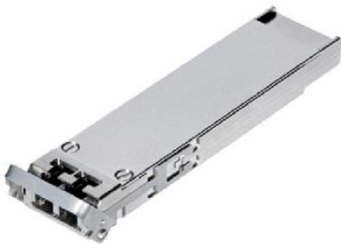
Figure 2. XFP Transceiver Module for the Cisco ONS Family

The XFP transceiver module (Figure 2) is a bidirectional device with a transmitter and receiver in the same physical package. The XFP module contains a 30-pin surface mount connector on the electrical interface and a duplex LC connector on the optical interface.