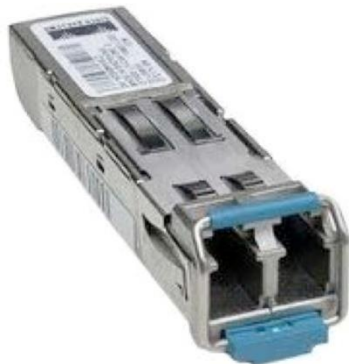
Figure 3. An SFP+ Transceiver Module for the Cisco ONS Family

An SFP+ transceiver module (Figure 3) is a bidirectional device with a transmitter and receiver in the same physical package. The module interfaces to the network through a connector interface on the electrical ports and through an LC termination connector on the optical ports. It is identical in size to SFP modules, but capable of 10-Gbps transmission.