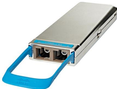
Figure 7. Cisco CPAK Module

Cisco CPAK 100GBASE fiber modules offer a selection of high-density 100-Gbps connectivity solutions. By using CMOS photonics technology, Cisco CPAK is smaller and consumes significantly less power than alternative form factors (Figure 7). They are fully interoperable with other IEEE-compliant interfaces.