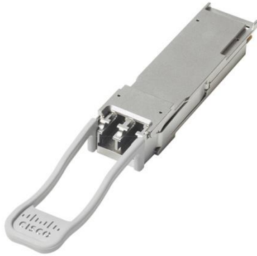
Figure 6. A QSFP+ Transceiver Module for the Cisco ONS Family