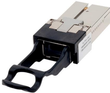
Figure 4. A CXP Transceiver Module for the Cisco ONS Family

An CXP transceiver module (Figure 4) is a bidirectional device with a transmitter and receiver in the same physical package. The module interfaces to the network through a connector interface on the electrical ports and through a multifiber push on (MPO) termination connector on the optical ports. It is dedicated usually for 100-Gbps transmission, and it is only capable of 100GBASE-SR10 connectivity.