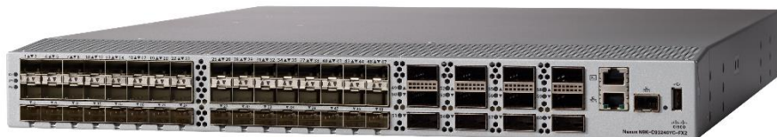
Figure 3. Cisco Nexus 93240YC-FX2 Switch

The Cisco Nexus 93240YC-FX2 Switch (Figure 3) is a 1.2RU switch that supports 4.8 Tbps of bandwidth and over 2.5bpps. The 48 ports of downlinks support 1/10/25-Gbps. The 12 uplinks ports can be configured as 40- and 100-Gbps ports, offering flexible migration options. The switch is ideal for a non-oversubscribed solution in a compact form factor. The switch has FC-FEC and RS-FEC enabled for 25Gbps support over longer distances.