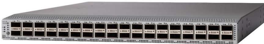
Figure 1. Cisco Nexus 9336C-FX2 Switch

The Cisco Nexus 9336C-FX2 Switch (Figure 1) is a 1RU switch that supports 7.2 Tbps of bandwidth and over 2.4 bpps. The switch can be configured to work as 1/10/25/40/50/100-Gbps offering flexible options in a compact form factor. Breakout is supported on all ports. Please see feature table below for more information.