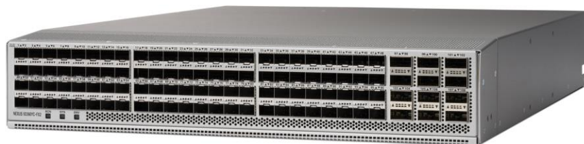
Figure 4. Cisco Nexus 93360YC-FX2 Switch

The Cisco Nexus 93360YC-FX2 Leaf Switch is an 2-Rack-Unit (2RU) Leaf switch that supports 7.2 Tbps of bandwidth and 2.4 bpps across 96 fixed 10/25G SFP+ ports and 12 fixed 40/100G QSFP28 ports (Figure 3). The 96 ports of downlinks support 1/10/25-Gbps. The 12 uplinks ports can be configured as 40- and 100-Gbps ports, offering flexible migration options. The switch has FC-FEC and RS-FEC enabled for 25Gbps support over longer distances. Please see feature table below for more information.