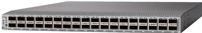
Figure 2. Cisco Nexus 9336C-FX2-E Switch

The Cisco Nexus 9336C-FX2-E Switch (Figure 2) is a 1RU switch that supports 7.2 Tbps of bandwidth and over 2.4 bpps. The switch can be configured to work as 1/10/25/40/50/100-Gbps or as 16-, 32-Gbps Fibre Channel ports [2] offering flexible options in a compact form factor. Breakout is supported on all ports. Please see feature table below for more information.