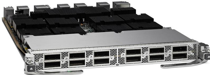
Table 1. Cisco Nexus 7700 Platform 100 Gigabit Ethernet Maximum Port Density