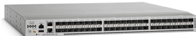
Figure 4. Cisco Nexus 3524 Switch

The Cisco Nexus 3524 has the following hardware configuration: