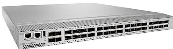
Figure 1. Cisco Nexus 3132Q Switch