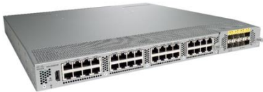
Figure 6. Cisco Nexus N2232TM-E

Cisco Nexus 2000 Series Fabric Extenders connect to a parent Cisco Nexus switch through their fabric links using CX1 copper cable, short-reach or long-reach optics, and the cost-effective Cisco Fabric Extender Transceivers. Fabric Extender Transceivers are optical transceivers that provide a highly cost-effective solution for connecting the fabric extender to its parent switch over OM3 or OM4 multimode fiber.