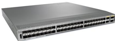
Figure 4. Cisco Nexus N2248PQ

The Cisco Nexus 2232PP 1 and 10 Gigabit Ethernet fabric extender (Figure 5) is an excellent platform for migration from 1 Gigabit Ethernet to 10 Gigabit Ethernet and unified fabric environments. It supports FCoE and DCB.