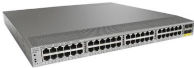
Figure 3. Cisco Nexus N2248TP-E

The Cisco Nexus 2248PQ 10 Gigabit Ethernet fabric extender (Figure 4) is the newest member of the Cisco Nexus fabric extenders. It supports high-density 10 Gigabit Ethernet environments and has 48 x 1 and 10 Gigabit Ethernet SFP+ host ports and 4 QSFP+ fabric ports (16 x 10 Gigabit Ethernet fabric ports). QSFP+ connectivity simplifies cabling while lowering power and solution cost. The Cisco Nexus 2248PQ 10GE Fabric Extender supports FCoE and a set of network technologies known collectively as Data Center Bridging (DCB) that increase the reliability, efficiency, and scalability of Ethernet networks. These features allow support for multiple traffic classes over a lossless Ethernet fabric, thus enabling consolidation of LAN, SAN, and cluster environments.