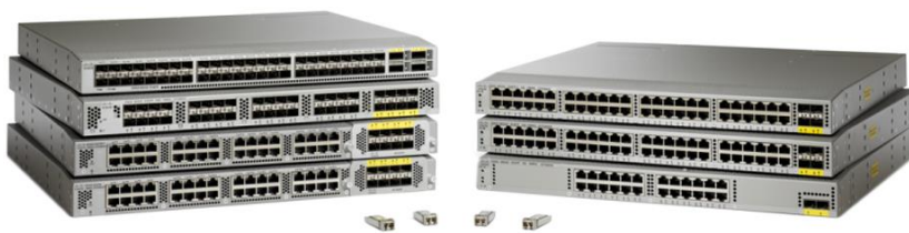
Figure 2. Cisco Nexus 2000 Series Fabric Extenders from Bottom Right to Top Left: Cisco Nexus 2224TP GE, 2248TP GE, 2248TP-E GE, 2232TM 10GE, 2232TM-E 10GE, 2232PP 10GE, and 2248PQ 10GE; Cost-Effective Fabric Extender Transceivers for Cisco Nexus 2000 Series and Cisco Nexus Parent Switch Interconnect Are in Front of the Fabric Extenders

The Cisco Nexus 2000 Series provides two types of ports: ports for end-host attachment (host interfaces) and uplink ports (fabric interfaces). Fabric interfaces, differentiated with a yellow color, are for connectivity to the upstream parent Cisco Nexus switch.