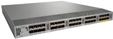
Figure 5. Cisco Nexus N2232PP

The Cisco Nexus 2232TM-E fabric extender (Figure 6) supports scalable 1/10GBASE-T environments, ease of migration from 1GBASE-T to 10GBASE-T, and effective reuse of existing structured cabling. It comes with an uplink module that supports eight 10 Gigabit Ethernet fabric interfaces. It is a superset of the Cisco Nexus 2232TM with the latest generation of 10GBASE-T PHY, enabling lower power and improved bit error rate (BER). The Cisco Nexus 2232TM-E supports DCB and LAN and SAN consolidation. FCoE support distances of up to 30 meters with Category 6a and 7 cables from the adapter to the fabric extender.