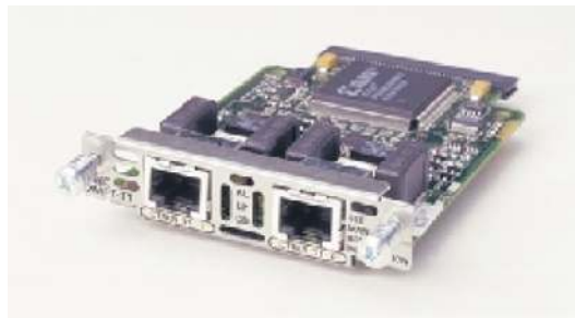
Figure 1. Cisco Dual Port T1/E1 Multiflex Voice/WAN Interface Card

VWIC-1MFT-T1, VWIC-2MFT-T1, VWIC-2MFT-T1-D1, VWIC-1MFT-E1, VWIC-2MFT-E1, VWIC-2MFT-E1-DI, VWIC-1MFT-G703, VWIC-2MFT-G703