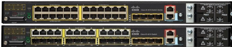
Table 2. Cisco IE 4010 Series Switches Models