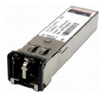
Figure 1. Cisco 100M Ethernet SFP