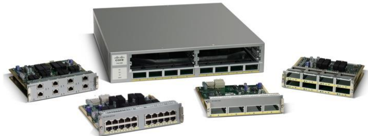
Figure 1. Cisco Catalyst 4900M Switch

The Cisco Catalyst 4900M configuration provides wire-speed connection, buffers to handle bursty traffic, and a comprehensive set of Layer 3 features required at the collapsed core and aggregation layer of the network. The Cisco Catalyst 4900M also supports a suite of ease-of-management features to simplify operations.