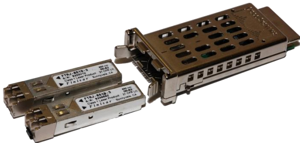
Figure 6. Cisco TwinGig Converter Module Converts a 10 Gigabit Ethernet X2 Interface into Two Gigabit Ethernet SFPs

The Cisco TwinGig Converter Module (Figure 6) converts a single 10 Gigabit Ethernet X2 interface into two Gigabit Ethernet port slots that can be populated with SFP optics, enabling customers to use Gigabit Ethernet SFPs on the same card in combination with 10 Gigabit Ethernet X2 optics. The Cisco OneX Converter Module is supported on all 10 Gigabit Ethernet modules of the Cisco Catalyst 4900M. The Cisco OneX converts an X2 interface into one SFP+ interface and uses the full range of Cisco SFP+ transceivers (Figure 7).