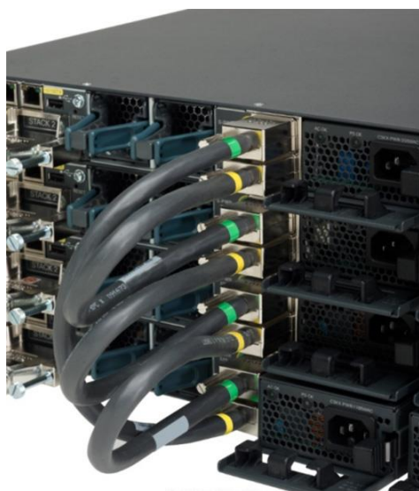
Figure 3. StackPower Connector

The Cisco Catalyst 3750-X Series introduces Cisco StackPower technology, innovative power interconnect system that allows the power supplies in a stack to be shared as a common resource among all the switches. Cisco StackPower unifies the individual power supplies installed in the switches and creates a pool of power, directing that power where it is needed. This feature is available in all Cisco Catalyst 3750-X Series Switches feature sets*. Up to four switches can be configured in a StackPower stack with the special connector at the back of the switch using the StackPower cable**, which is different than the StackWise cables. (See Figure 3.)