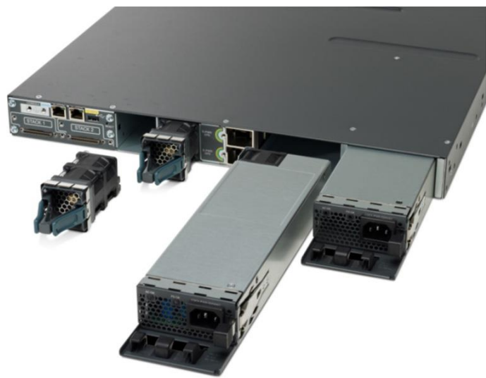
Figure 5. Dual Redundant Power Supplies

The Cisco Catalyst 3750-X Series and 3560-X Series Switches support dual redundant power supplies. The switch ships with one power supply by default, and the second power supply can be purchased at the time of ordering the switch or at a later time. If only one power supply is installed, it should always be in the power supply bay 1. (See Figure 5).