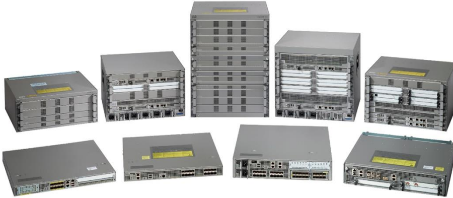
Figure 2. Cisco ASR 1001-X Router