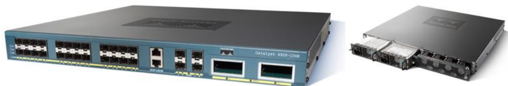
Figure 1. Cisco Catalyst 4928 10 Gigabit Ethernet Switch with Hot-Swappable Fan Tray and Power Supplies

The Cisco Catalyst 4928 10 Gigabit Ethernet Switch offers 28 wire-speed 1000BASE-X Small Form-Factor pluggable (SFP) ports and 2 wire-speed 10 Gigabit Ethernet (X2 optics) ports. Exceptional reliability and serviceability are delivered with optional internal AC or DC 1 + 1 hot-swappable power supplies and a hot-swappable fan tray with redundant fans (Figure 1).