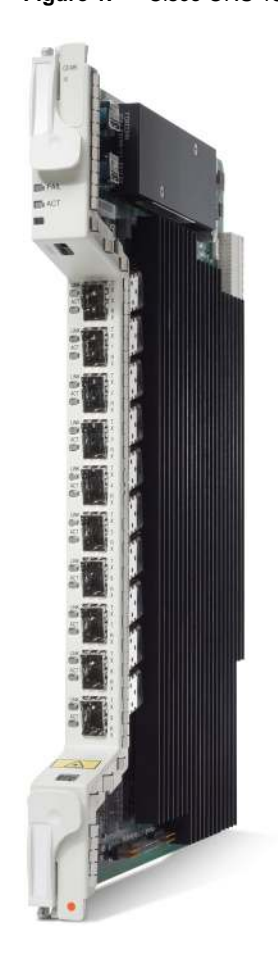
Figure 1. Cisco ONS 15454 CE-Series 10-Port Multirate Ethernet Card

The Cisco CE-MR card includes the following features: