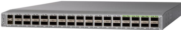
Figure 3. Cisco Nexus 9332C Switch

The Cisco Nexus 9332C is the smallest form-factor 1-Rack-Unit (1RU) spine switch for Cisco ACI that supports 6.4 Tbps of bandwidth and 2.3 bpps across 32 fixed 40/100G QSFP28 ports and 2 fixed 1/10G SFP+ ports(Figure 3). Breakout is not supported on ports 1 to 32. The last 8 ports marked in green support wire-rate MACsec encryption 2 .