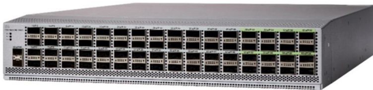
Figure 2. Cisco Nexus 9364C Switch

The Cisco Nexus 9332C is the smallest form-factor 1-Rack-Unit (1RU) spine switch for Cisco ACI that supports 6.4 Tbps of bandwidth and 2.3 bpps across 32 fixed 40/100G QSFP28 ports and 2 fixed 1/10G SFP+ ports(Figure 3). Breakout is not supported on ports 1 to 32. The last 8 ports marked in green support wire-rate MACsec encryption 2 .