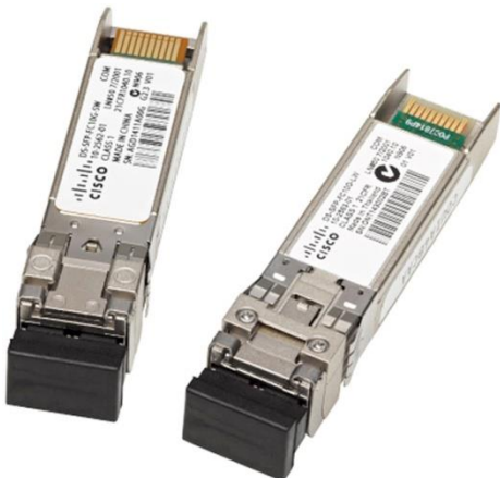
Figure 4. Cisco 10-Gbps Fibre Channel SFP+ Modules

Cisco 10-Gbps Fibre Channel SFP+ modules (Figure 4) provide Fibre Channel connectivity for the 10-Gbps Fibre Channel ports on the MDS 9000 Family platform. Two types are available: the Cisco Fibre Channel Shortwave SFP+ (part number DS-SFP-FC10G-SW) and the Cisco Fibre Channel Longwave SFP+ (part number DS-SFP-FC10G-LW).