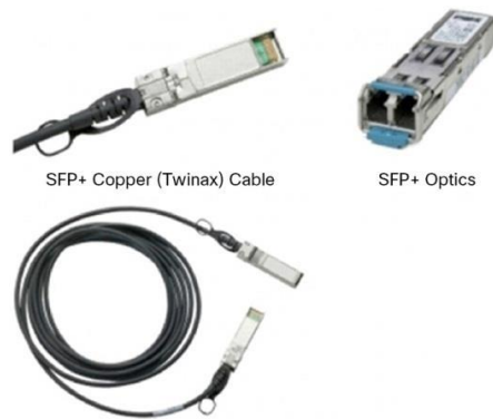
Figure 5. Cisco 10GBASE SFP+ Modules

Cisco 10-Gbps Ethernet SFP+ modules (Figure 5) provide 10-Gbps Ethernet connectivity for the Cisco MDS 9500 10-Gbps 8-Port FCoE Module and MDS 9250i Multiservice Fabric Switch.