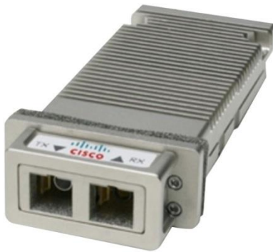
Figure 13. Cisco 10-Gbps Ethernet X2 Transceiver

The Cisco Ethernet X2 Transceiver short-reach module (up to 300m; part number DS-X2-E10G-SR) enables high-performance Fibre Channel connectivity for the MDS 9000 Family 10-Gbps Fibre Channel switching module to an existing Ethernet Dense Wavelength-Division Multiplexing (DWDM) transponder (Figure 13). The data format transmitted is identical to that transmitted by the Fibre Channel transceiver (DS-X2-FC10G-SR), except the Fibre Channel packets are clocked at the 10 Gigabit Ethernet rate to carry Fibre Channel packets over a 10-Gbps Ethernet DWDM infrastructure. The MDS 9000 Family 10-Gbps Fibre Channel switching module automatically detects DS-X2-E10G-SR; no software configuration is required.