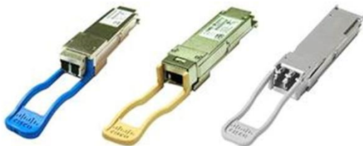
Figure 6. Cisco 40GBASE SFP+ Modules

Three types of 40GBASE QSFP modules are supported for MDS 40-Gbps line cards (Figure 6).