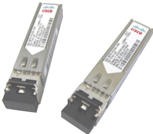
Figure 2. Cisco 4-Gbps Fibre Channel SFP Modules

Cisco 4-Gbps Fibre Channel SFP modules (Figure 2) provide cost-effective Fibre Channel connectivity for 1/2/4-Gbps ports on the MDS 9000 Family platform. Three types are available: the Cisco Fibre Channel Shortwave SFP (part number DS-SFP-FC4G-SW), the Cisco 4-km Fibre Channel Longwave SFP (part number DS-SFP-FC4G-MR), and the Cisco 10-km Fibre Channel Longwave SFP (part number DS-SFP-FC4G-LW). Each offers 1/2/4 Gbps autosensing Fibre Channel connectivity.