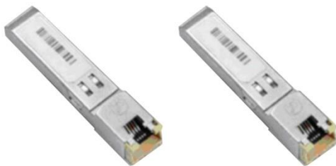
Figure 8. Cisco Copper Gigabit Ethernet SFP Modules

For even more cabling flexibility, the MDS 9000 Family offers Cisco Copper Gigabit Ethernet SFP modules. Based on the 1000BASE-T standard, Copper Gigabit Ethernet SFP modules (Figure 8) provide cost-effective connectivity for data center applications. Copper Gigabit Ethernet SFP modules (part number DS-SFP-GE-T) allow the use of standard Category 5 Unshielded Twisted Pair (UTP) cabling for Ethernet connectivity.