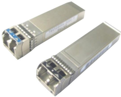
Figure 11. Cisco 16-Gbps Fibre Channel SFP+ Transceivers

The Cisco 16-Gbps Fibre Channel SFP+ Transceivers (Figure 11) provide Fibre Channel connectivity for 4/8/16-Gbps ports on the MDS 9000 Family platform. Three types are available: the Cisco Fibre Channel Shortwave SFP+ (part number DS-SFP-FC16G-SW), the Cisco Fibre Channel Longwave SFP+ (part number DS-SFP-FC16G-LW), and the Cisco Fibre Channel Extended Longwave SFP+ (part number DS-SFP-FC16GELW). Each offers 4/8/16-Gbps autosensing Fibre Channel connectivity.