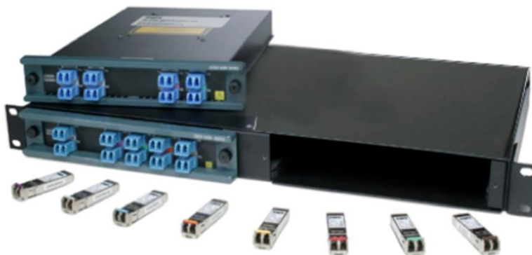
Figure 14. Cisco CWDM Extended Distance SFP Solution

The CWDM SFP solution enables the transport of up to eight channels over one pair of single-mode fiber strands, enabling enterprises to increase the bandwidth of an existing optical infrastructure without adding new fiber strands. The solution can be used in parallel with other Cisco SFP devices on the same platform.