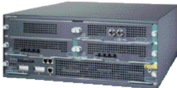
Figure 1. Cisco 7304 Chassis

The Cisco 7304 provides numerous connectivity options, from DS0 to Gigabit Ethernet and OC-48/STM-16, in an architecture engineered for high availability and multiprotocol support. With built-in Gigabit Ethernet ports and support for Cisco 7200 Series port adapters, the Cisco 7304 is a leading-edge, flexible, feature-rich router for the network edge.