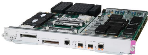
Figure 1. Cisco 7600 Route Switch Processor 720

The Cisco 7600 RSP 720 uses the same high-performance 720-Gbps crossbar switch fabric as that used by the Cisco Catalyst® 6500 Series Supervisor Engine 720 and combines it with a new, revised, and application-specific integrated circuit (ASIC)-based forwarding engine. This single module delivers 40 Gbps of switching fabric capacity per slot, supporting 4-port 10 Gigabit Ethernet and 48-port 10/100/1000 density line cards. With hardware-enabled forwarding for IPv4, IPv6 Unicast and Multicast, and Multiprotocol Label Switching (MPLS), the Cisco RSP 720 can provide high-speed central forwarding with rich packet processing features such as access control lists (ACLs), quality of service (QoS), MPLS VPNs, and more. Combining the Cisco 7600 RSP 720 with distributed forwarding cards (DFCs), the total system performance can scale up to 400 Mpps.