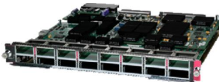
Figure 1. 6800 Series 16-Port 10 Gigabit Ethernet Fiber Module