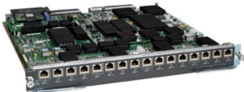
Figure 2. 6800 Series 16-Port 10 Gigabit Ethernet Copper Module

The 6800 Series 16-port 10 Gigabit Ethernet Copper module (Figure 1) provides up to 176 10 Gigabit Ethernet Copper ports in a single Cisco Catalyst 6513-E Switch chassis, 352 10 Gigabit Ethernet Copper ports in a Cisco Catalyst 6500 Virtual Switching System (VSS) 2T and is primarily designed for data center access with a secondary use case for switch-to-switch connectivity.