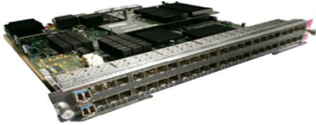
Figure 5. 6800 Series 48-Port 10/100/1000 Interface Copper Module WS-X6848-TX-2T/2TXL