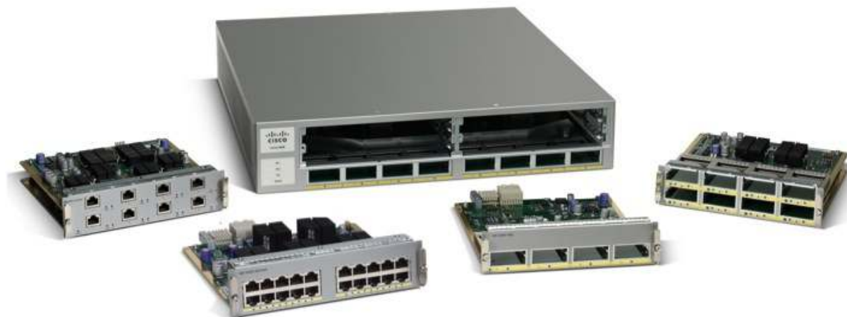
Figure 1. Cisco Catalyst 4900M Switch

The Cisco Catalyst 4900M configuration provides wire-speed connection, buffers to handle bursty traffic, and a comprehensive set of Layer 3 features required at the collapsed core and aggregation layer of the network. The Cisco Catalyst 4900M also supports a suite of ease-of-management features to simplify operations.