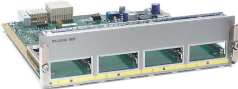
Figure 4. 8-Port (2:1) 10 Gigabit Ethernet (X2) Half Card (Compatible with Cisco TwinGig Converter Module)