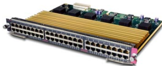
Figure 1 48-Port Line Card (WS-X4448-GB-RJ45)