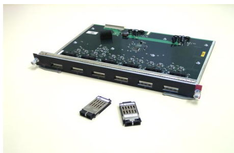
Figure 3 6-Port Line Card