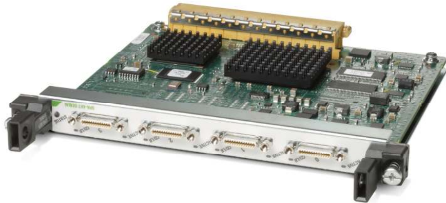
Figure 1. Cisco 4-Port Serial Shared Port Adapter

The Cisco® I-Flex approach combines shared port adapters (SPAs) and SPA interface processors (SIPs), providing an extensible design that helps prioritize data, voice, and video services. Enterprise and service provider customers can take advantage of improved slot economics resulting from modular port adapters that are interchangeable across Cisco routing platforms. The I-Flex design maximizes connectivity options and offers superior service intelligence through programmable interface processors that deliver line-rate performance. I-Flex enhances speed-to-service revenue and provides a rich set of quality of service (QoS) features for premium service delivery while effectively reducing the overall cost of ownership. This data sheet contains the specifications for the Cisco 4-Port Serial Shared Port Adapter (Figure 1).