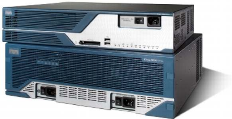
Figure 1. Cisco 3825 and 3845 Integrated Services Routers

The Cisco 3800 Series Routers feature embedded security processing, generous performance, high memory capacity, and high-density interfaces that deliver the performance, availability, and reliability required for scaling mission-critical security, IP telephony, business video, network analysis, and web applications in the most demanding enterprise environments. Built for performance, these routers deliver multiple concurrent services up to wire-speed T3/E3 rates.