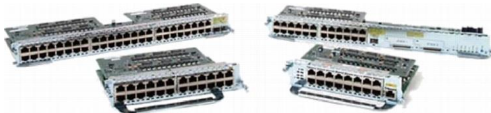
Figure 1. Cisco EtherSwitch Service Modules with IEEE 802.3af Support

The new Cisco EtherSwitch service modules, pictured in Figure 1, greatly expand the capabilities of integrated switching within Cisco routers by providing support for new features such as IEEE 802.3af Power over Ethernet (PoE), local Layer 3 switching, Cisco Network Assistant and Cisco Emergency Responder, and Cisco StackWise™ interfaces (available on NME-XD-24-1S-P only), as well as common software and features with Cisco Catalyst® 3750 and 3750-E Series Switches. Additionally, the new Cisco EtherSwitch service modules are the first modules that can take full advantage of the increased performance capabilities and new form factors of the enhanced network module slot on Cisco integrated services routers. (Table 7 provides a list of supported platforms).