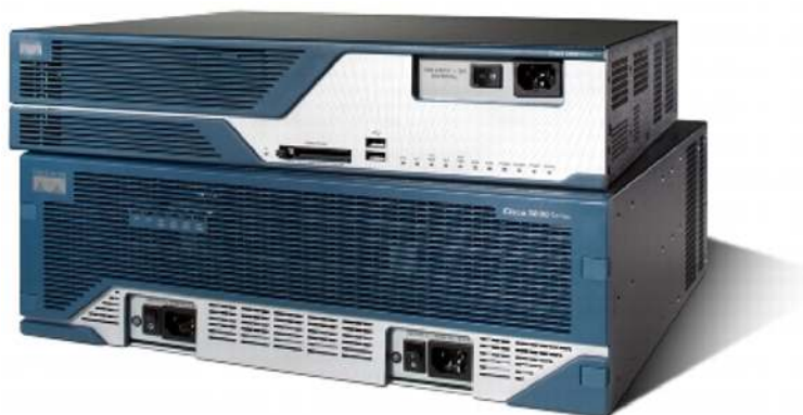
Figure 1. Cisco 3825 and Cisco 3845 Integrated Services Router

Cisco Systems ® , Inc. redefines branch office routing with a portfolio of Integrated Services Routers optimized for secure, wire-speed delivery of concurrent data, voice, video, and wireless services. Founded on 20 years of innovation, the Cisco ® 3800 Series Integrated Services Routers provide customers with unparalleled network agility, performance, and intelligence. The Cisco 3800 Series transparently integrates advanced technologies, adaptive services, and secure enterprise communications into a single, resilient system. The Cisco 3800 Series routers ease deployment and management, lower network cost and complexity, and provide unmatched investment protection. The Cisco 3800 Series routers feature embedded security processing, generous performance and high memory capacity, and high-density interfaces that deliver the performance, availability, and reliability required for scaling mission-critical security, IP telephony, business video, network analysis, and Web applications in the most demanding enterprise environments. Built for performance, the Cisco 3800 Series routers deliver multiple concurrent services up to wire-speed T3/E3 rates.