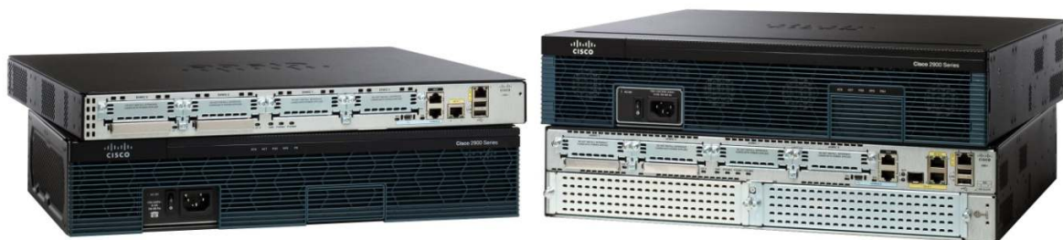
Figure 1. Cisco 2900 Series Integrated Services Routers

Cisco® 2900 Series Integrated Services Routers build on 25 years of Cisco innovation and product leadership. The new platforms are architected to enable the next phase of branch-office evolution, providing rich media collaboration and virtualization to the branch while maximizing operational cost savings. The Integrated Services Routers Generation 2 platforms are future-enabled with multi-core CPUs, support for high capacity DSPs (Digital Signal Processors) for future enhanced video capabilities, high powered service modules with improved availability, Gigabit Ethernet switching with enhanced POE, and new energy monitoring and control capabilities while enhancing overall system performance. Additionally, a new Cisco IOS® Software Universal image and Services Ready Engine module enable you to decouple the deployment of hardware and software, providing a flexible technology foundation which can quickly adapt to evolving network requirements. Overall, the Cisco 2900 Series offer unparalleled total cost of ownership savings and network agility through the intelligent integration of market leading security, unified communications, wireless, and application services.