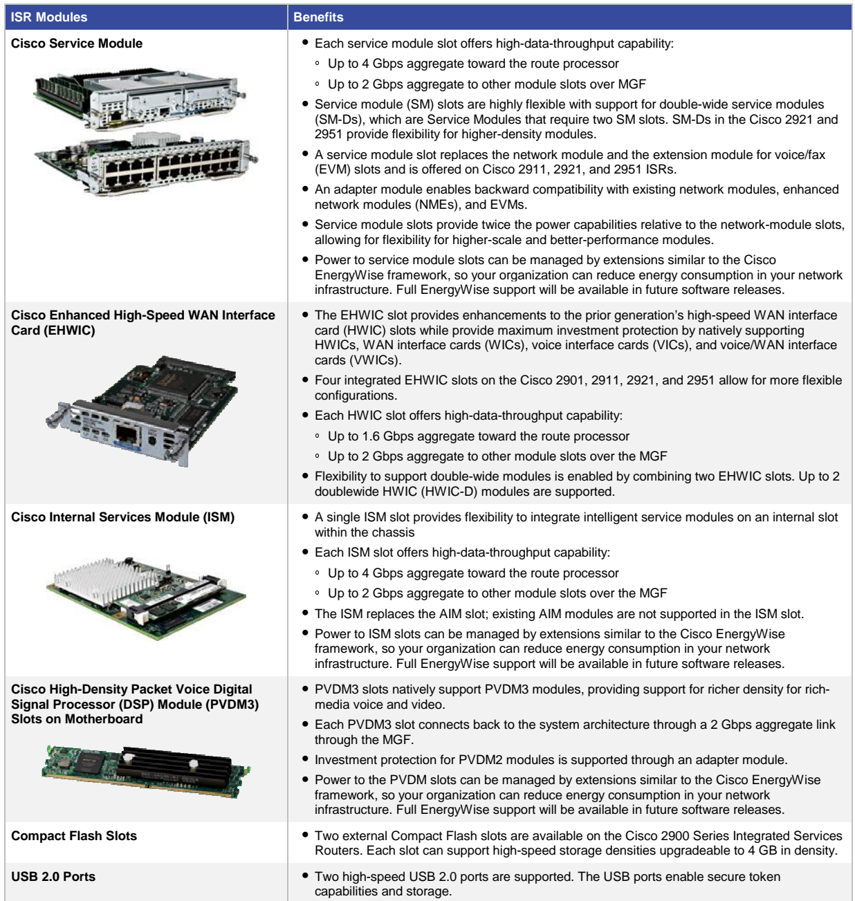
Table 3. Modularity Features and Benefits