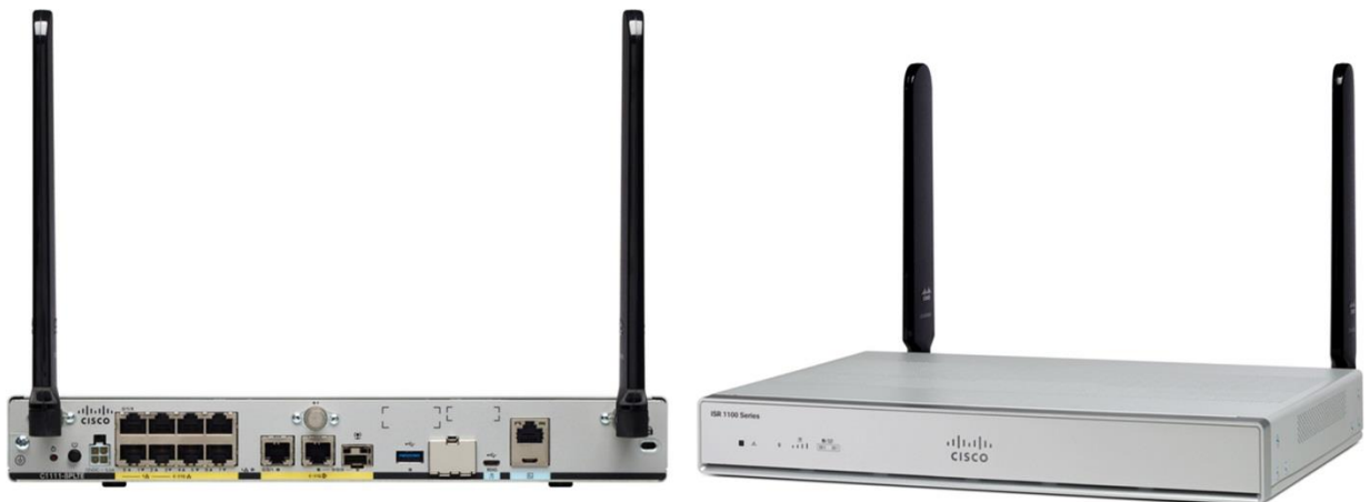
Figure 2. Cisco 1100-4P ISR, Back and Front View