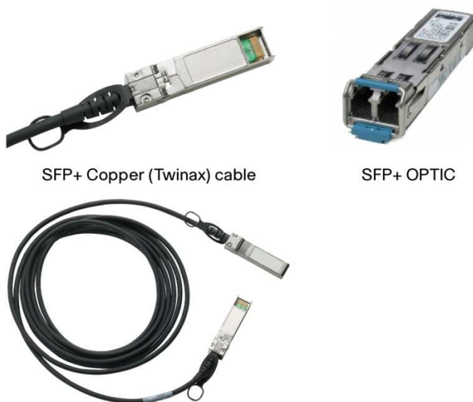
Figure 1. Cisco 10GBASE SFP+ Modules

The Cisco® 10GBASE SFP+ modules (Figure 1) offer customers a wide variety of 10 Gigabit Ethernet connectivity options for data center, enterprise wiring closet, and service provider transport applications.