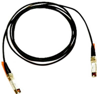
Figure 3. Cisco Direct-Attach Twinax Copper Cable Assembly with SFP+ Connectors