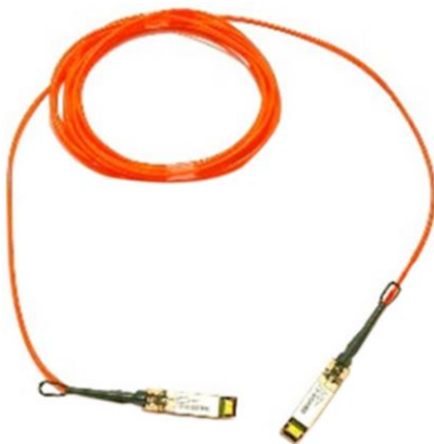
Figure 4. Cisco Direct-Attach Active Optical Cables with SFP+ Connectors

Cisco SFP+ Active Optical Cables (Figure 4) are direct-attach fiber assemblies with SFP+ connectors. They are suitable for very short distances and offer a cost-effective way to connect within racks and across adjacent racks. Cisco offers Active Optical Cables in lengths of 1, 2, 3, 5, 7, and 10 meters.