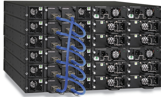
Figure 1: Up to 12 Brocade ICX 7450 switches can be stacked together using two full-duplex QSFP+ 40 Gbps ports that provide a fully redundant backplane with 960 Gbps of stacking bandwidth.

scale out as demand grows and new technologies emerge.