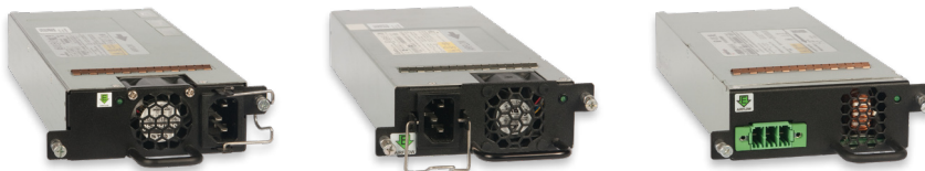
Figure 4: The Brocade ICX 7450 offers a choice of 250 W AC, 1,000 W AC, or 510 W DC power supply options. All power supplies are available with front-to-back or back-to-front airflow.

system. In addition, support for Terminal Access Controller Access Control System (TACACS/TACACS+) and RADIUS authentication helps ensure secure operator access.