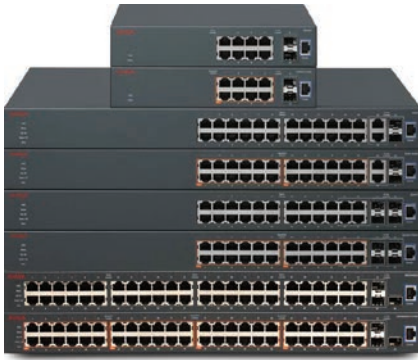
Figure 1: The ERS 3500 product family