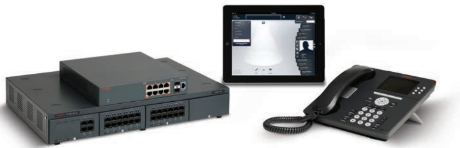
Figure 2: ERS 3500 with IP Office, the Avaya Flare® Communicator for iPad Device and an Avaya 9600 handset

Avaya has also validated interoperability between the ERS 3500 and the IP Office system to ensure the two products work together seamlessly. This eliminates any complexities associated with having to provision, manage and troubleshoot a third party Switch with the Avaya voice / unified communications infrastructure. A Technical Solutions Guide, available to partners and end customers, showcases best practice configurations, ensuring optimal performance of the solution.