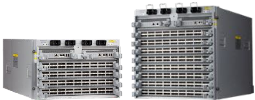
Arista 7500E Series Modular Data Center Switches

With front-to-rear airflow, redundant and hot swappable supervisor, power, fabric and cooling modules the system is purpose built for data centers. The 7500E Series is energy efficient with typical power consumption of under 4 watts per port for a fully loaded chassis. All of these attributes make the Arista 7500E an ideal platform for building reliable, low latency, resilient and highly scalable data center networks.