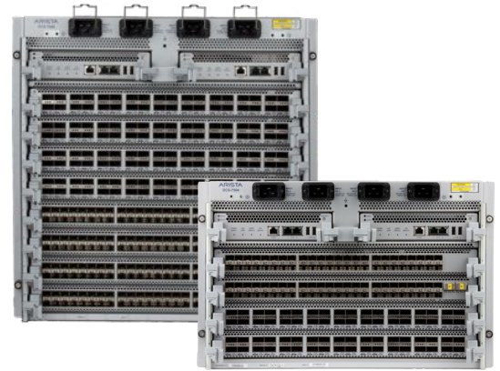
Arista 7500 Series Chassis

The 7500E series switches are equipped with four 2900W AC power supplies. The power supplies are 2+2 grid redundant and hot-swappable. The power supplies are gold climate saver rated and have an efficiency of over 90% with single stage conversion to the internal 12V DC voltage.