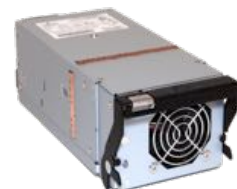
Arista 7500 Series Power Supply