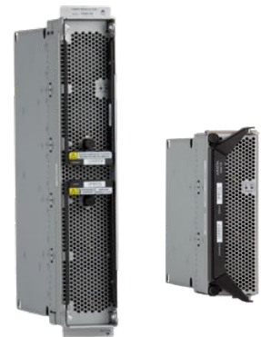
Arista 7500 Series Fabric Modules