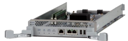
Arista 7500 Series Supervisor