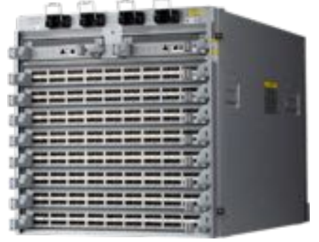
Arista 7500E Series Modular Data Center Switches