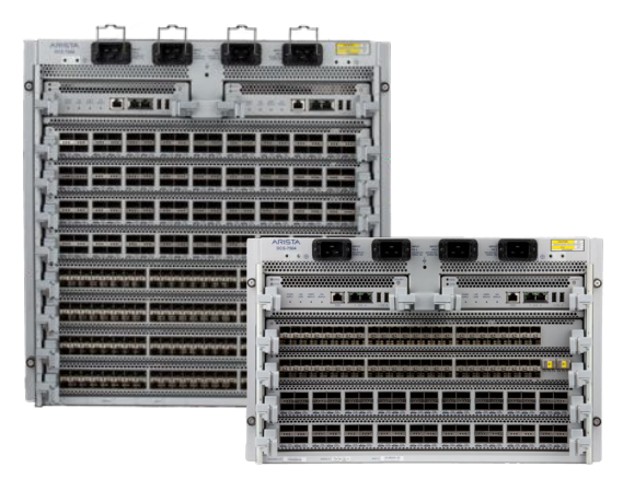
Arista 7500 Series Chassis

The 7500E series switches are equipped with four 2900W AC power supplies. The power supplies are 2+2 grid redundant and hot-swappable. The power supplies are gold climate saver rated and have an efficiency of over 90% with single stage conversion to the internal 12V DC voltage.