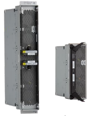
Arista 7500 Series Fabric Modules