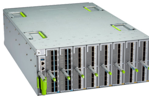
Arista 7388X5: 128 ports of 200G or 64 ports of 400G

Combined with Arista EOS the 7388X5 series deliver advanced features for hyperscale networks, serverless compute, big data farms and machine learning clusters.