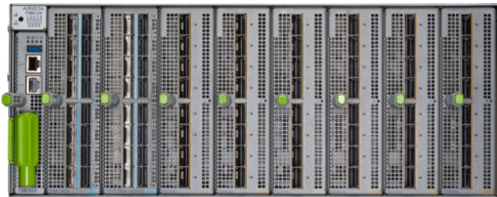
Arista 7388X5: System Front 128 ports of 100G

The Arista 7388X5 series switches support port to port latency as low as 825 ns in cut-through mode, and a 114 MB packet buffer with a large shared pool allowing for superior burst absorption compared to multi-chip systems or pre-allocated fixed per-port buffering.