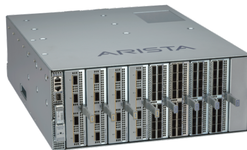
Arista 7368X4: 128 ports of 100G or 32 ports of 400G

Combined with Arista EOS the 7368X4 series deliver advanced features for hyperscale networks, server-less compute, big data farms and machine learning clusters.