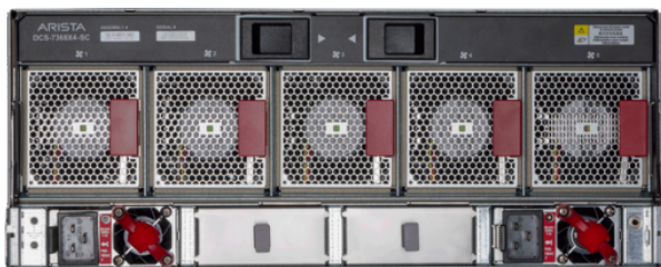
System Rear (Front to Rear Airflow)